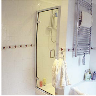
Shower 35 Litres

Make a bar chart showing how much water is used for each activity.