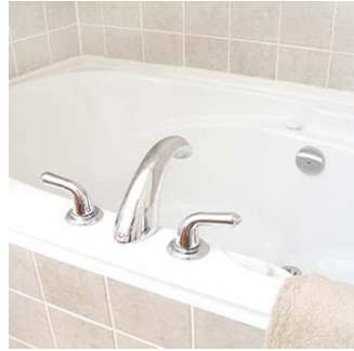
Bath 80 litres