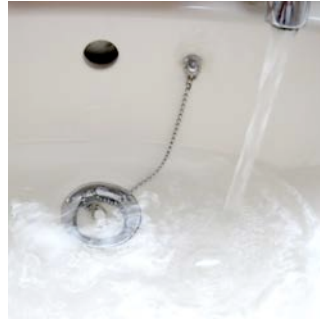
Plug In 6 litres